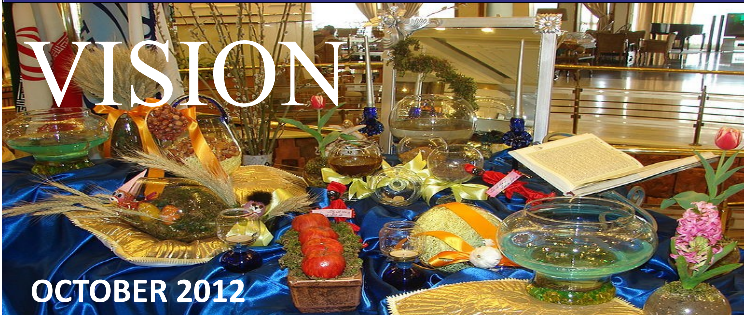
a Haft Sen Table as seen at Laleh Hotel, Tehran