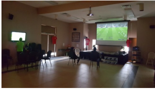
Gamers in singles competition on the main screen and TV

Most games were a close affair with winning goals scored late. The gamers couldn't resist showing off their skill sets either. Seasoned players tactically analyzing how to beat their opponent, slick passing and some jaw dropping goals were the highlights of the day.