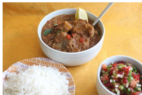
Lamb potato curry served with plain boiled rice and kuchumbar

LEARN HOW TO PREPARE CURRY CHAWAL DELICIOUS RAS CHAWAL DHAN SAK AND MUCH MORE