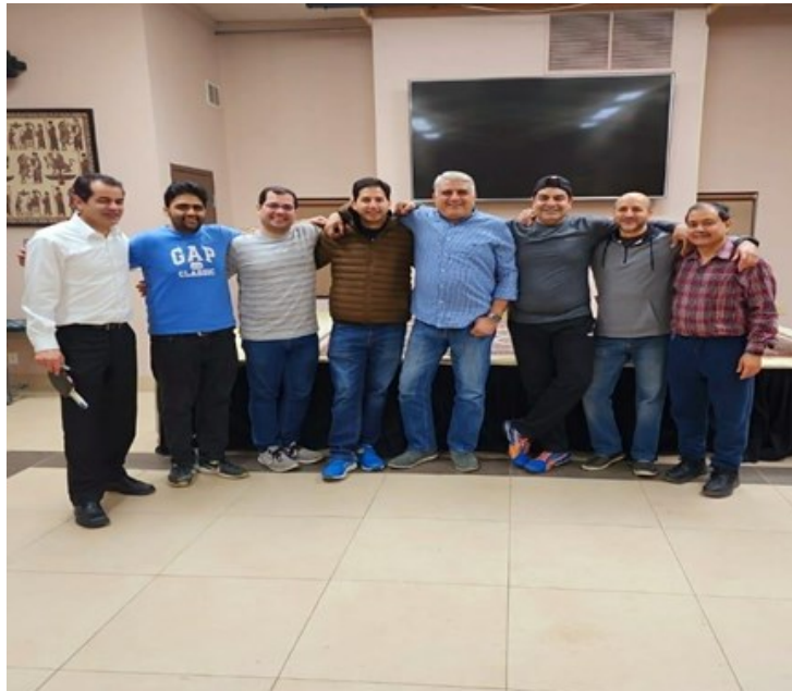
Zoroastrian Cricket Club group at Gymkhana Nights